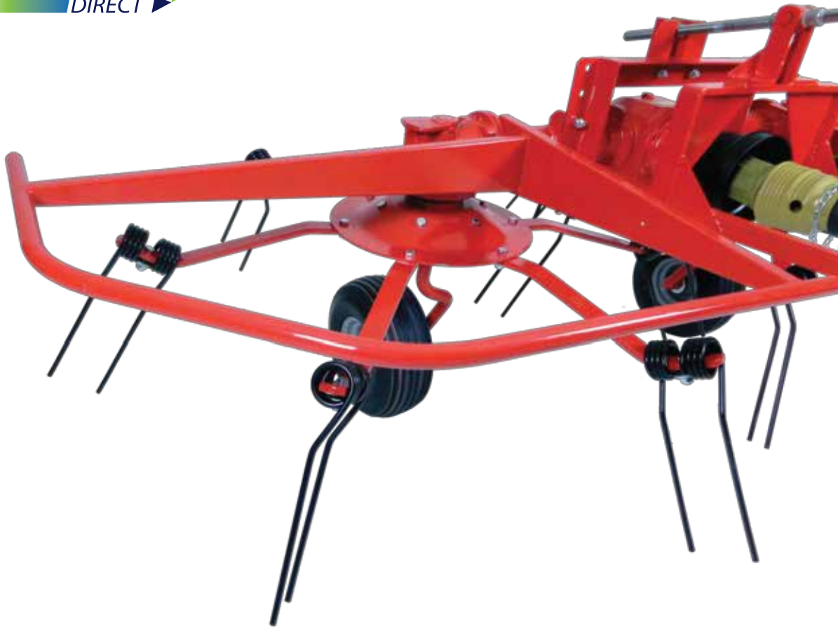
Figure3 right side

The wing guards are installed by taking 2 bolts out of the castings on each side, then replacing with the guard attached.