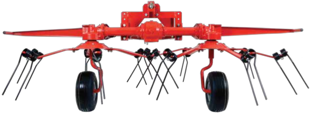
Figure 1 rear view