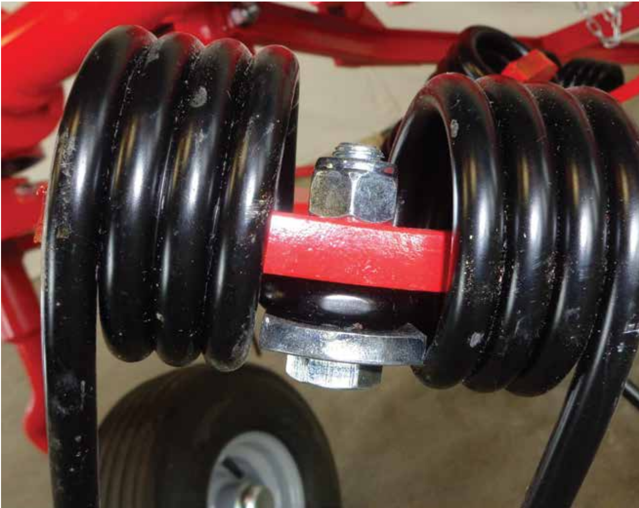
Figure5 Tine attachment

A socket will clear the spring to tighten the nut.