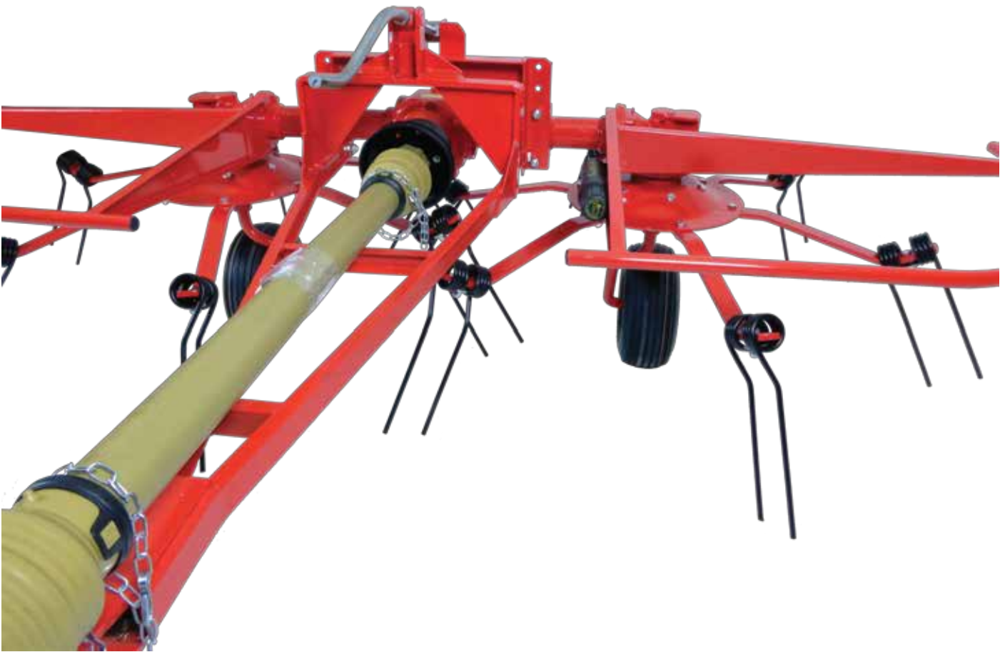
Figure 2 front view

Pay close attention to the direction of the angled sweep back portion of the tines when assembling. The left and right side are different. The thick washers with the flats go over the loop of spring.