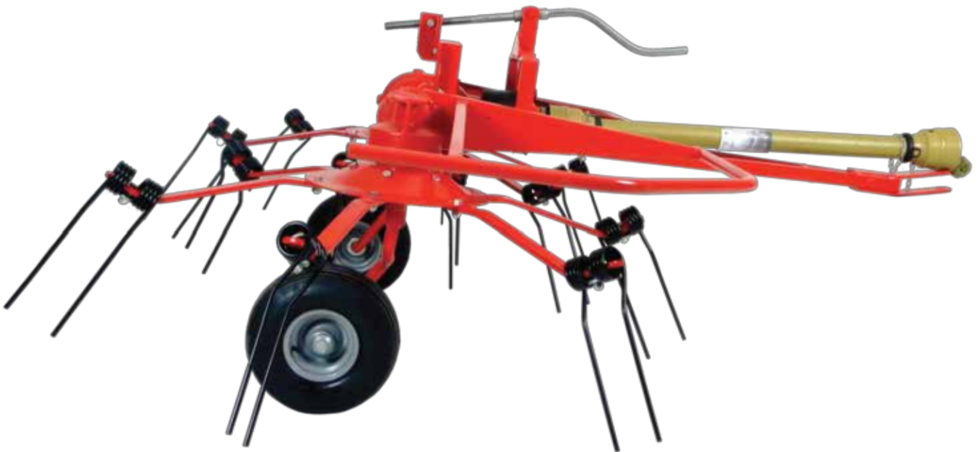
Figure4 side view for reference

The wing guards are installed by taking 2 bolts out of the castings on each side, then replacing with the guard attached.