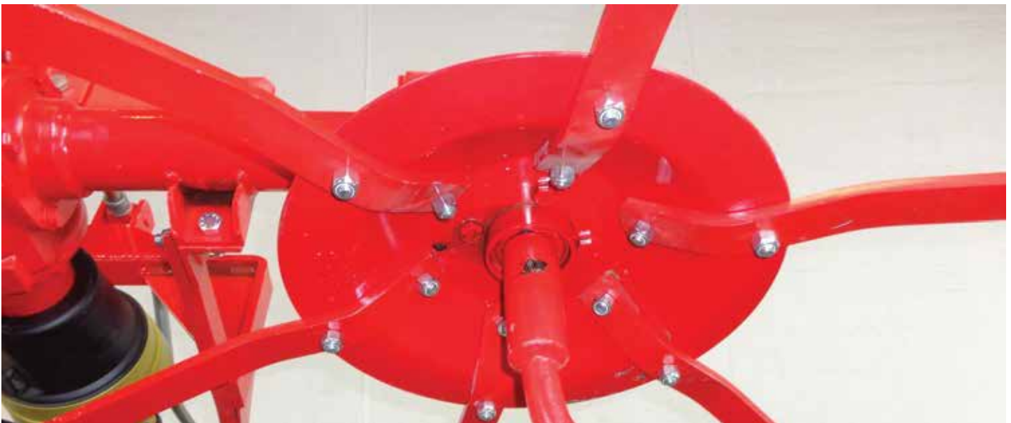
Figure6 arms attachment

A socket will clear the spring to tighten the nut.