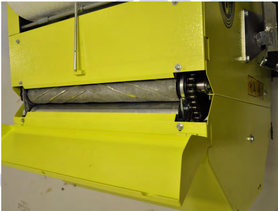
Figure 3 Drive chains can be accessed by opening the top cover