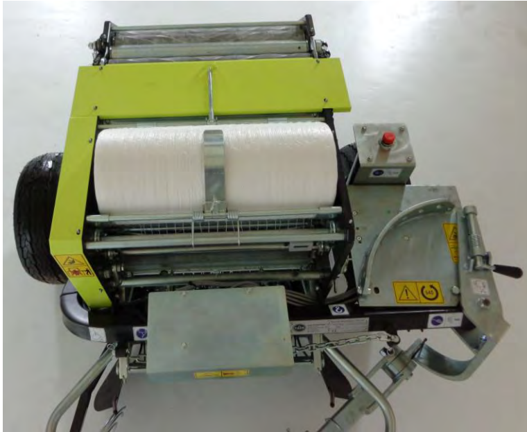
Figure 1 new baler before assembly

When the baler is unpacked, it will look like figure 1. The net wrap may or may not be installed