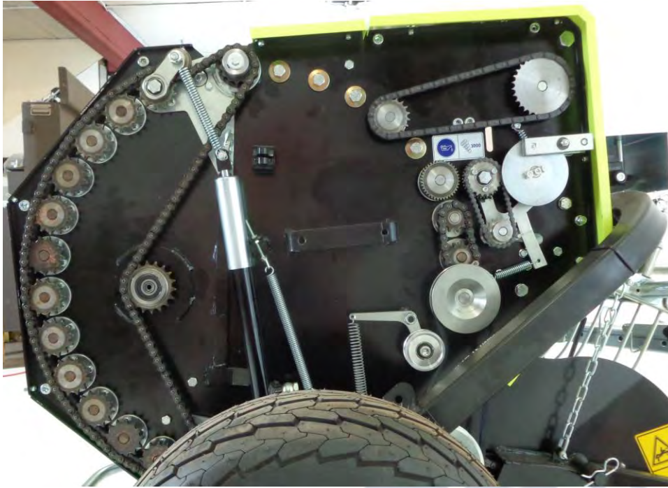
Figure 4 left side of baler opened to show drive chain for rear rollers and 3 auxiliary drive chains

When lubricating the chains, use oil. Grease will not penetrate inside the chain where lubrication is most needed. Take care to not get oil onto the belt or the disk brake assembly.